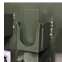
5. Parking Stand