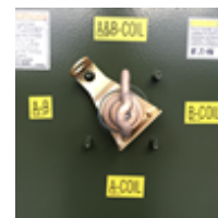
2. Loadbreak Switch